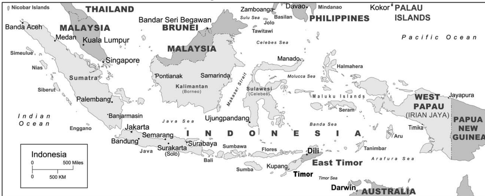
Figure 2. Indonesia

Source: Map Resources. Adapted by CRS. (K.Yancey 4/12/04)