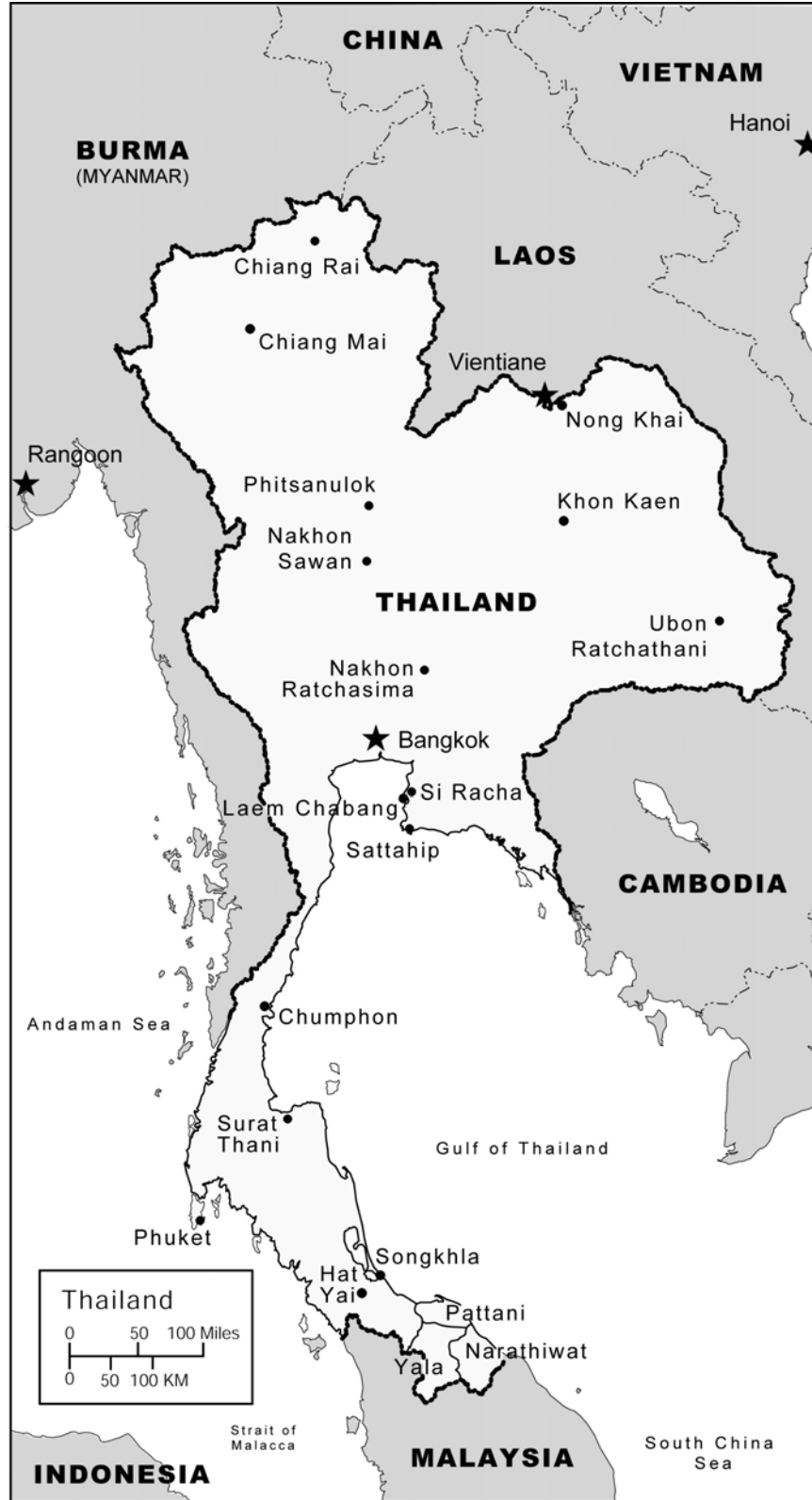
Figure 5. Thailand